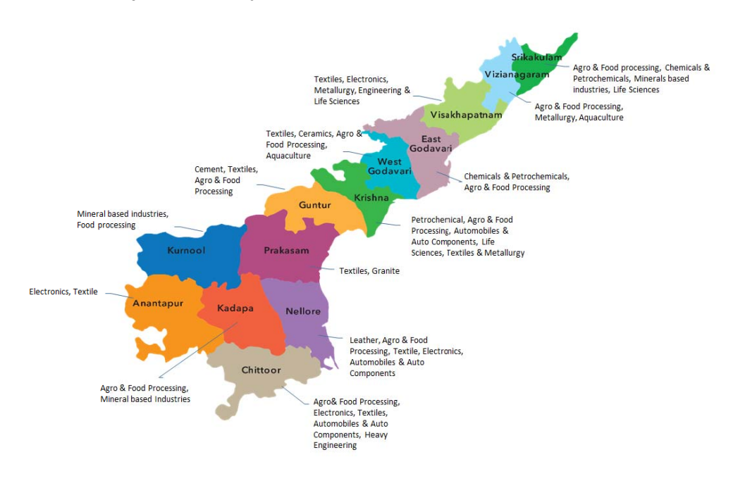
Chart 1: Sector wise major districts by output

Andhra Pradesh, over the years, has established a strong presence in agro and food processing, textiles, chemicals & petrochemicals, pharmaceuticals, metallurgy, electronics and electrical engineering sectors.